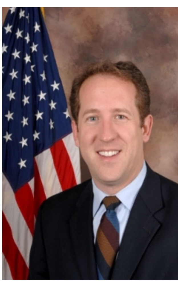
U.S. Representative Adrian Smith (NE) Ports-to-Plains Alliance Caucus