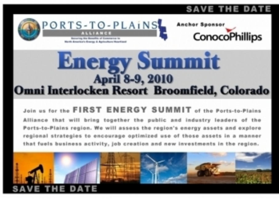
Click on image for larger view

Be sure to mark your calendar and plan to join us for the First Energy Summit of the Ports-to-Plains Alliance scheduled April 8-9, 2010 at the beautiful Omni Interlocken Resort in Denver (Broomfield), Colorado. Conoco-Phillips is anchor sponsor for this event. More details and online registration will be available soon.