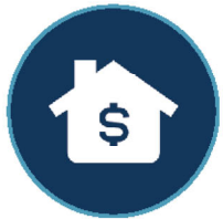
Median Annual Household Income