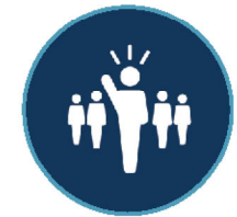
Employment Growth (Jobs)

The economy of West and South Texas has grown consistently over the last 20 years.