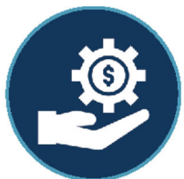
Annual Gross Domestic Product

Source: U.S. Census (1990) and Moody's Analytics (2020 and 2050 Projection Data)