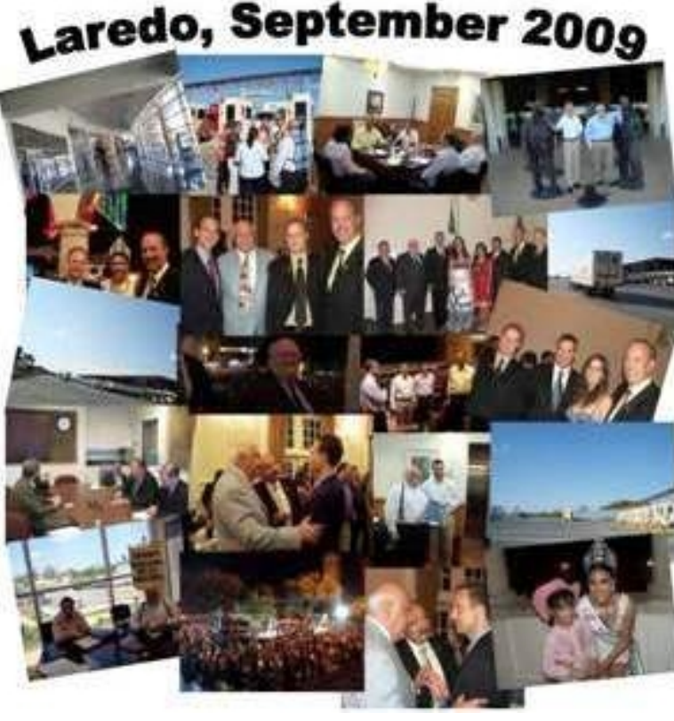
Click on photo to enlarge