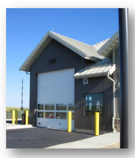
Figure 5. Wildhorse Border Crossing