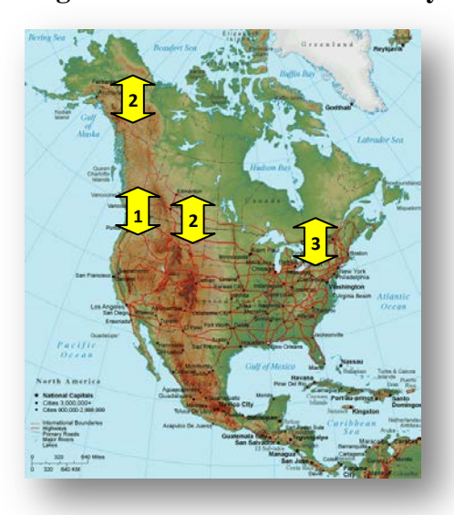
Figure 2. US/Canadian Gateways

(Sands 2009). Commercial traffic is greatest through the Great Lakes corridor (75%), followed by the Rural Gateway (13%) and Cascadian Gateway (12%) (Bureau of Transportation Statistics 2011). Each gateway is comprised of multiple border crossings, which serve vital cross-border transportation corridors that connect businesses in the U.S. and Canada to suppliers and customers on both sides of the border.