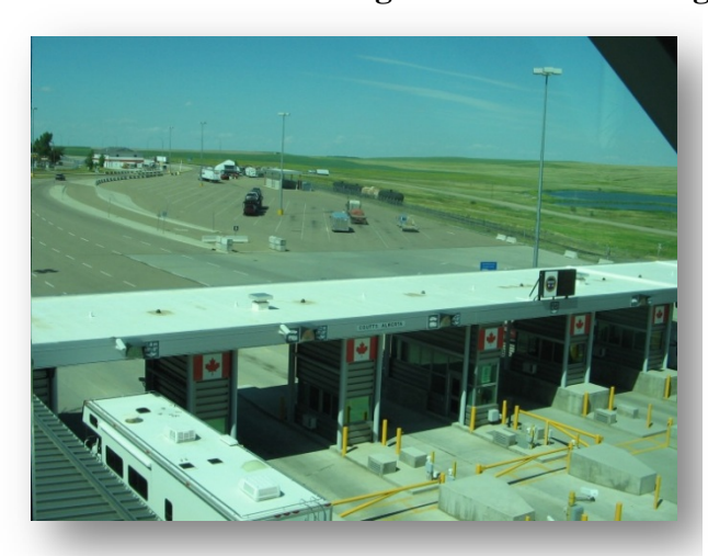
Figure 6. Coutts/Sweetgrass Border Crossing

identification provided by NEXUS for individual travelers and FAST for commercial drivers are accepted in all five lanes into the U.S. and in specific lanes into Canada during key hours. The crossing connects U.S. Interstate 15 with Canadian Route 4, a high quality two- lane roadway that connects the border crossing to major Canadian cities such as Lethbridge, Calgary, and Edmonton.