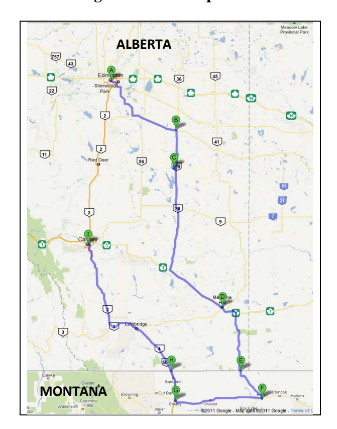
Figure 4. Field Trip Route

Wild Horse on a weekday morning and travelled to Havre, Montana, then went on to the border at Coutts/Sweetgrass in the afternoon of the same day. I returned to Shelby, MT for evening meetings. I crossed the Coutts/Sweetgrass border again the following morning and journeyed on to Calgary (Figure 4).